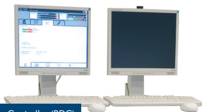
Buhrs Data Controller (BDC)