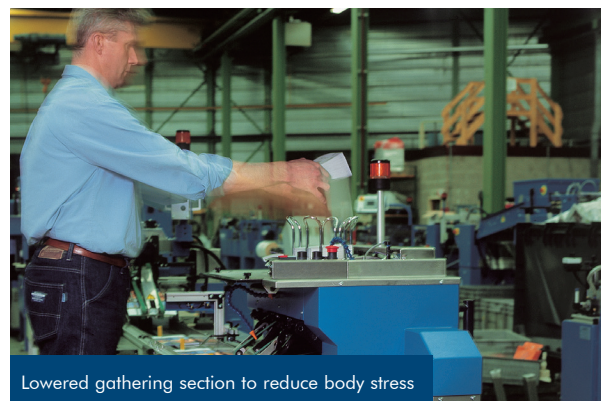
Lowered gathering section to reduce body stress

Safe and ergonomic systems enable you to improve the confidence of operators, without limiting your system’s net output. With the lowered gathering section it is much easier to load the feeders.